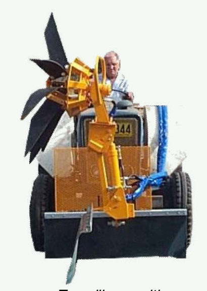
Travelling position (old model)

Manufacturers and designers of quality horticultural equipment