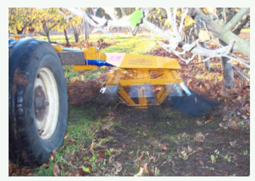
Orchard SADIE Sweeping with rubber flaps (old model)

SADIE eliminates the need for hand raking and has proven to be important in the control of Black Spot & Weevils.