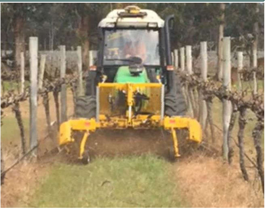
Width setting from 2.2m to 4m is achieved by two synchronised hydraulic rams. Another hydraulic ram raises the heads in any width setting.

SADIE's clean sweep reduces the amount of herbicide required to maintain weed free strips