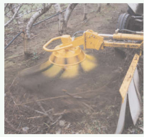
Vineyard SADIE Sweeping with Nylon Bristles (old model)